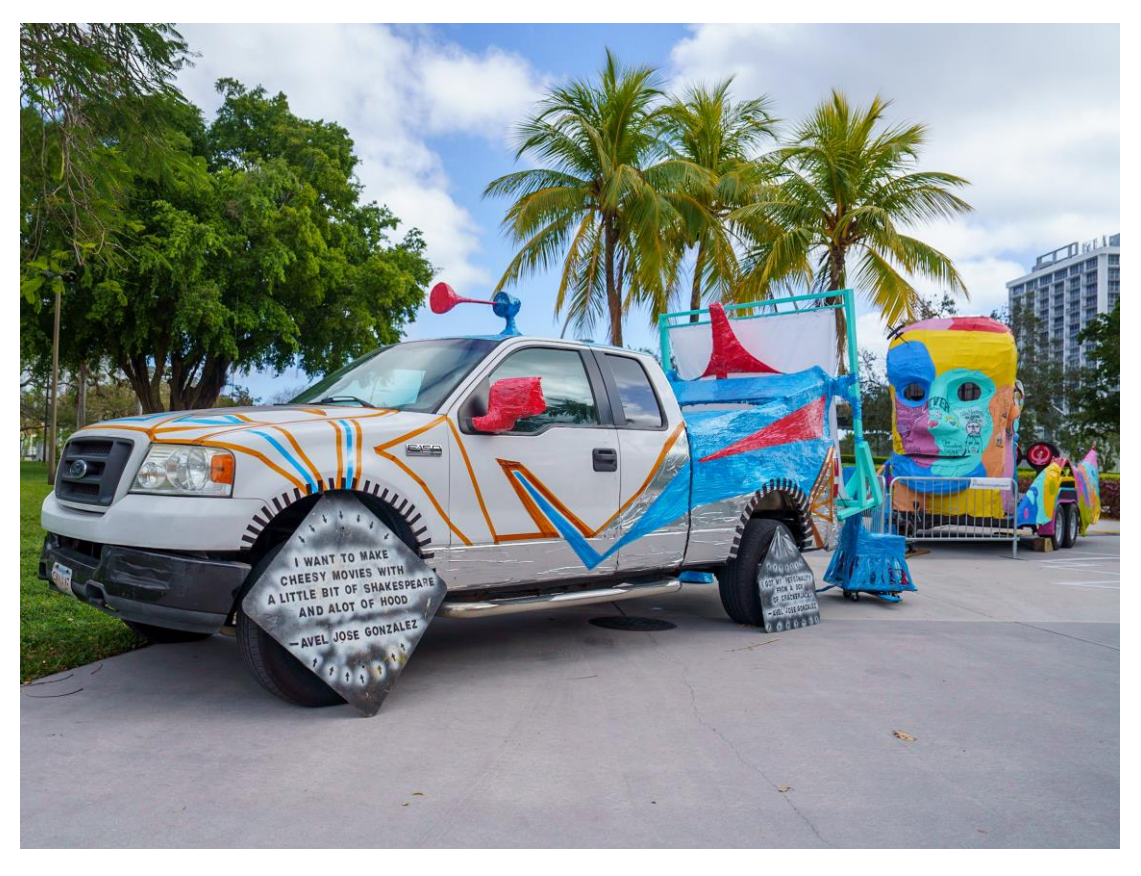
The Revolving Museum's "WORD PLAY: Florida Road Show" (2023), a traveling public art project, educational program, and performance event.