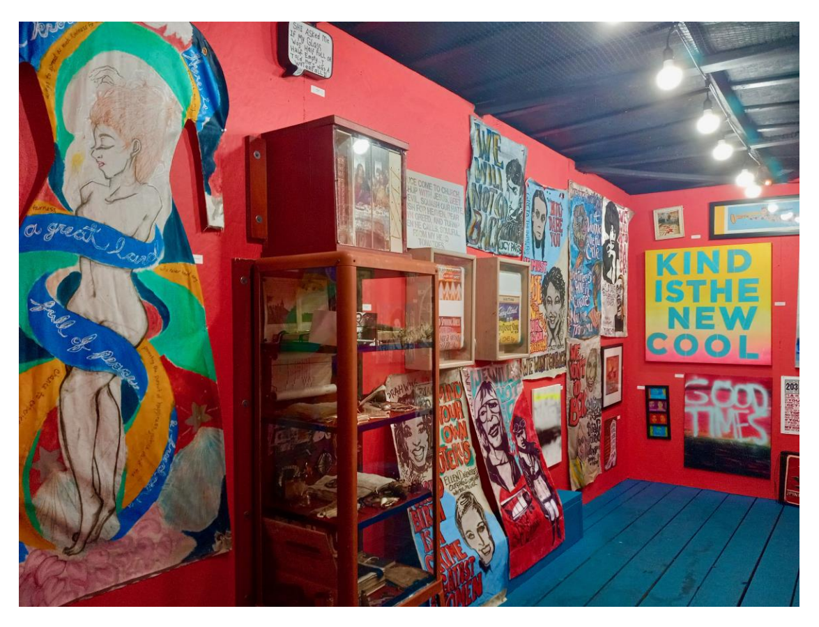
The Revolving Museum's "WORD PLAY: Florida Road Show" (2023), a traveling public art project, educational program, and performance event. View of interior gallery.