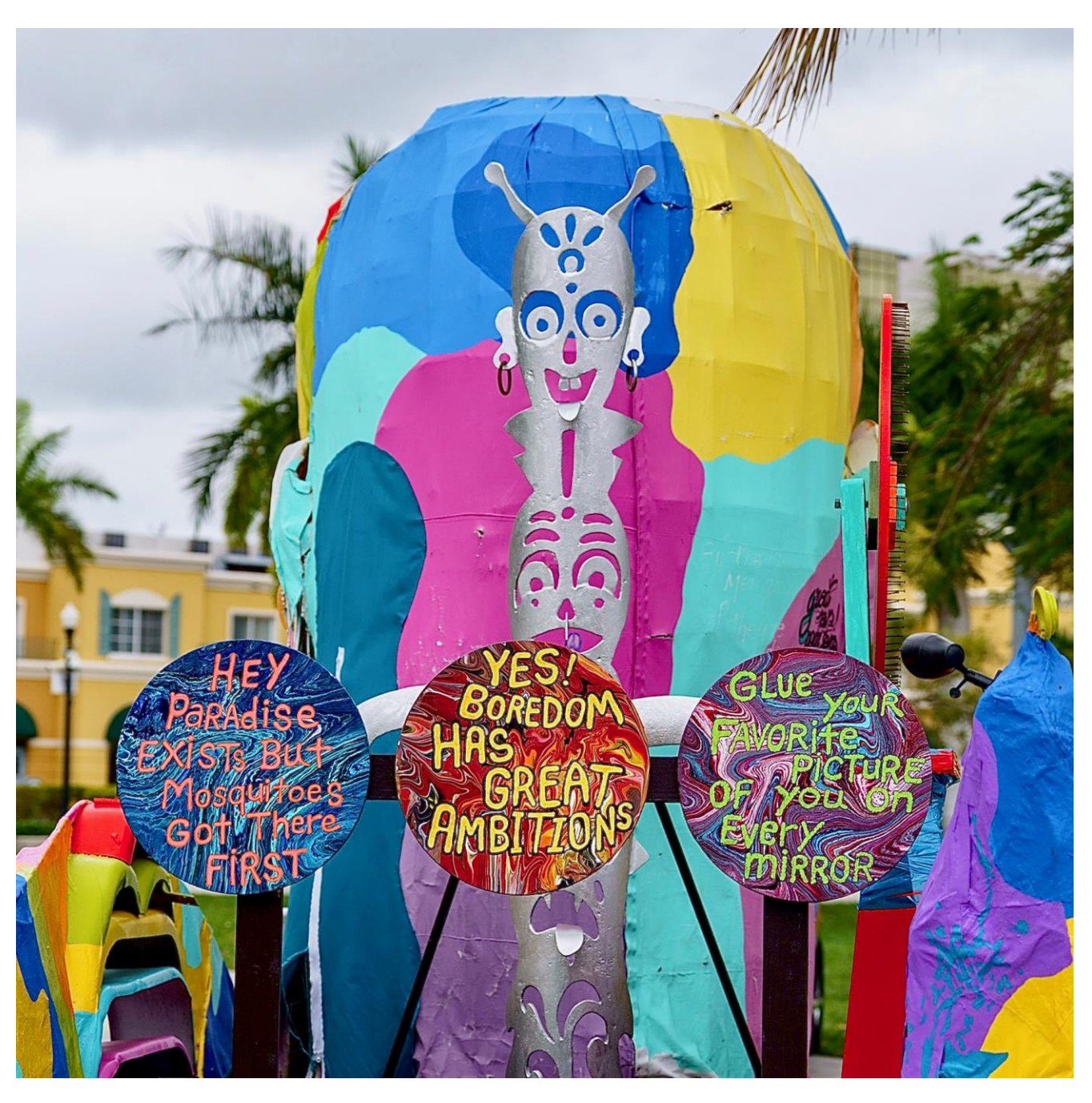
The Revolving Museum's "WORD PLAY: Florida Road Show" (2023), a traveling public art project, educational program, and performance event.